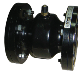
Flanged End Pinch Valve

In order to ensure 100% tightness, pipe line pressure must be min. \Delta p 1,5 bar lower than air supply pressure.